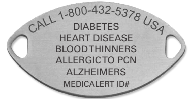
Sample engraving on back of Classic ID.

Indicate bracelet size (inches): _____ 5" 5½" 6" 6½" 7" 7½" 8" 8½" 9" 9½" 10"